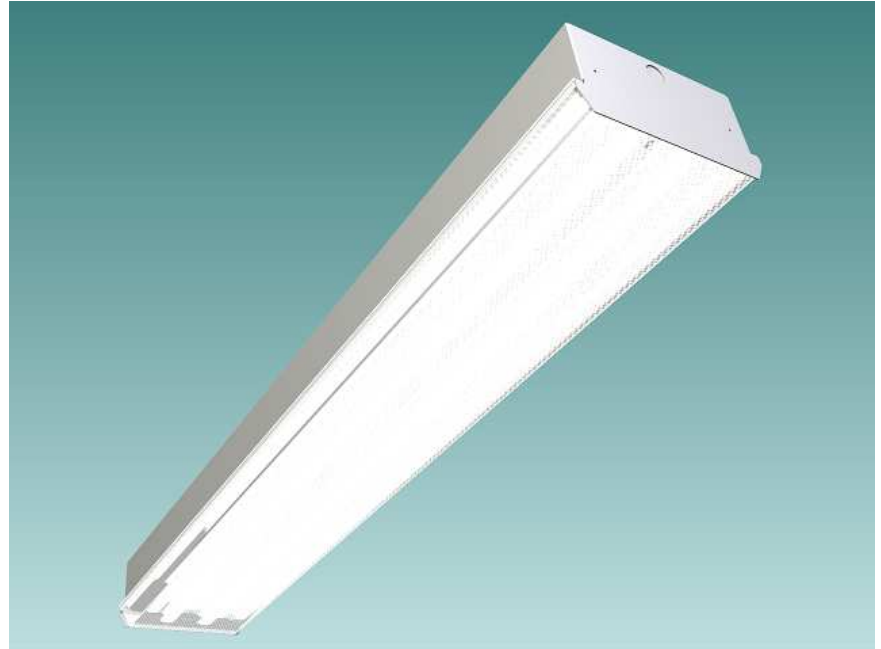
LS-WRAP (2 Lamp)

Ideal for general purpose indoor applications.