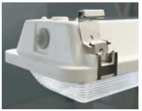
Stainless Steel Latch