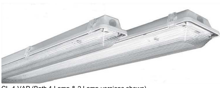
CL-4-VAP (Both 1 Lamp & 2 Lamp versions shown)